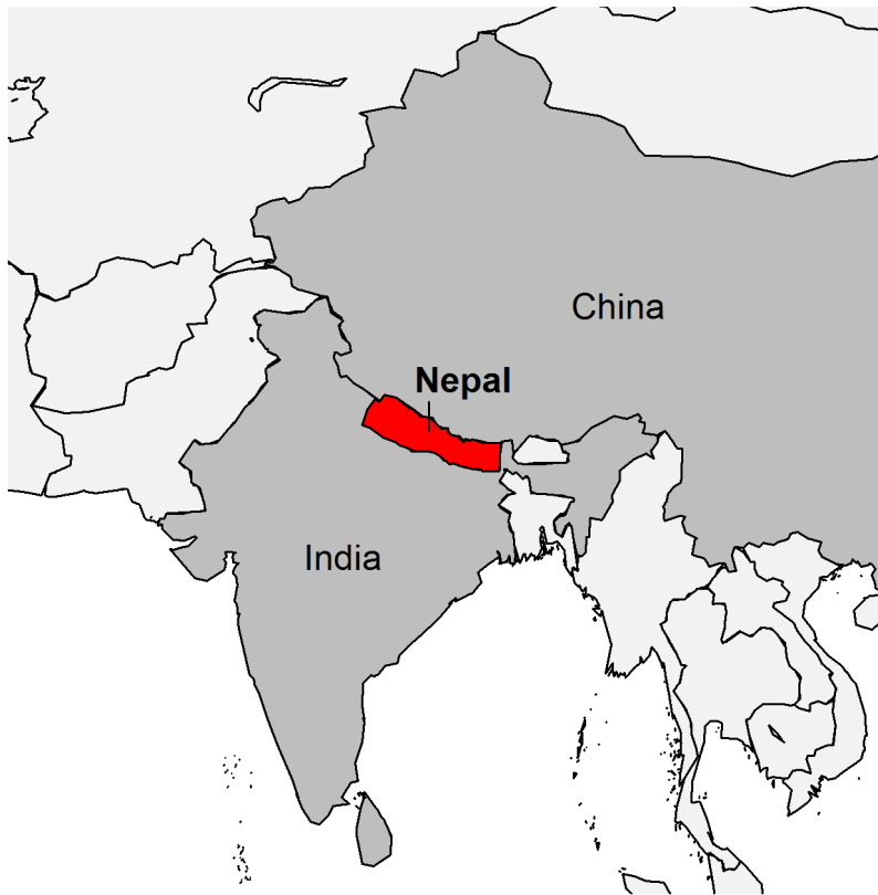
Figure 1. Nepal, in red, bordered by India in the south, and China in the north. doi:10.1371/journal.pntd.0002634.g001